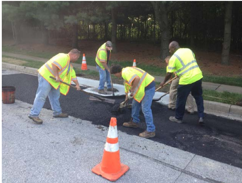
Figure 1: Asphalt at Cullen Way