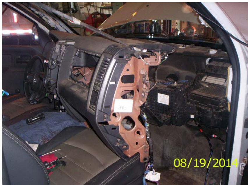
Figure 2: Truck 206 Heater Core Replacement