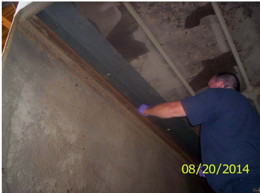
Figure 3: Truck 250 Vac Body Corrosion Repairs