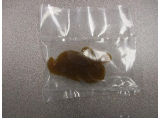
Edible Gummy Marijuana